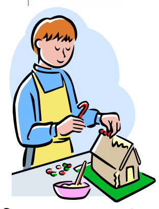
Create your own masterpiece for the Downtown Alliance's "Gingerbread Home Show!"